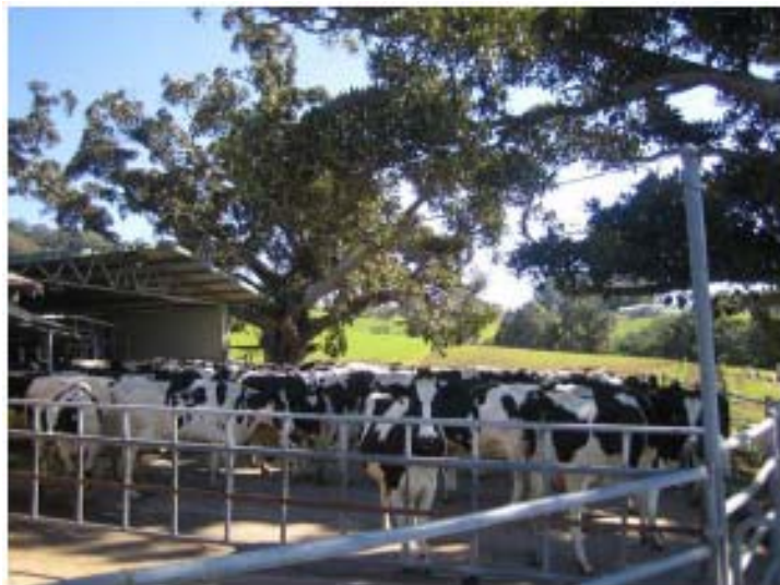
Exhibit 4.1 Cows waiting in dairy holding area

After visiting the various NLIS facilities, the delegates were impressed by Australia's leadership in implementing its livestock identification, traceability and product integrity system.